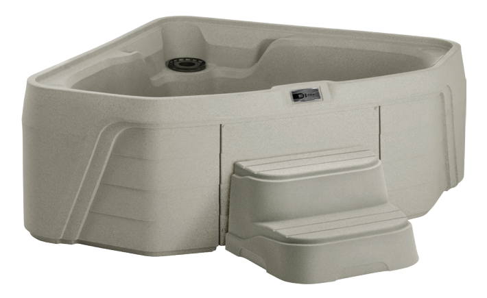
Tristar shown in Sand