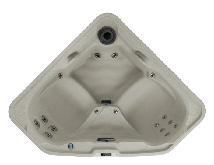
Tristar shown in Sand