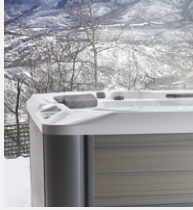
FiberCor® High-Density Insulation