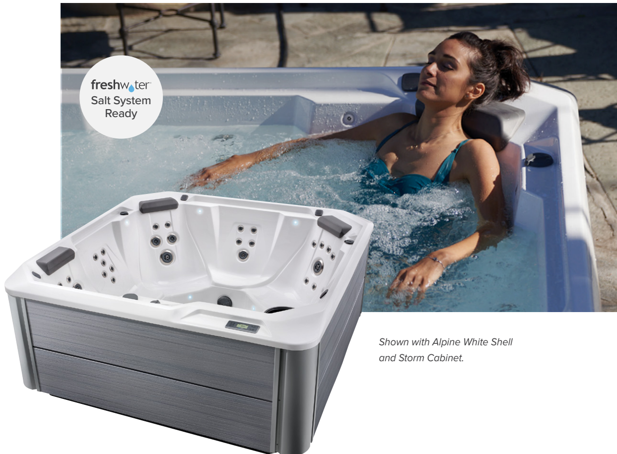
Shown with Alpine White Shell and Storm Cabinet.