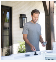
FreshWater® Salt System Ready